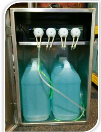
Can hold 5Litre Enzyme x 2